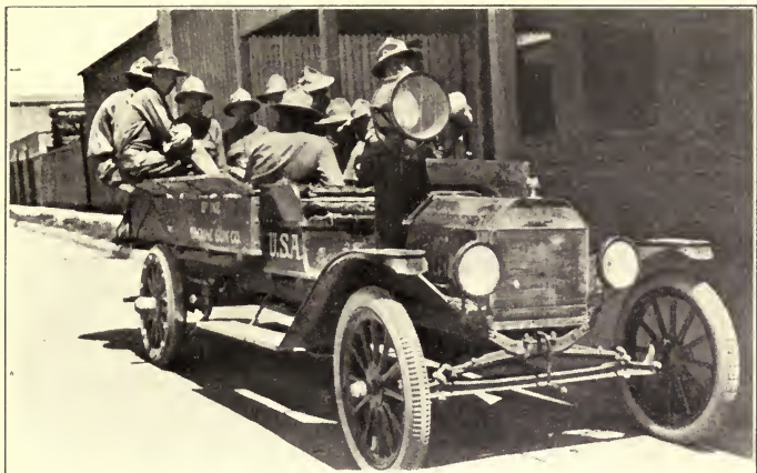
OFF FOR TOWN